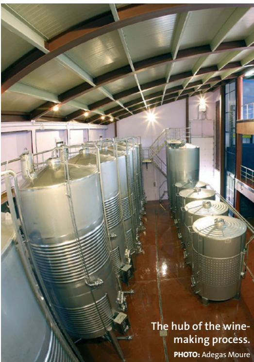
The hub of the wine-making process.