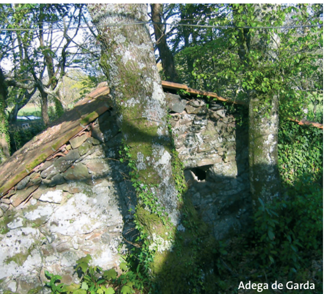
Adegas de Garda