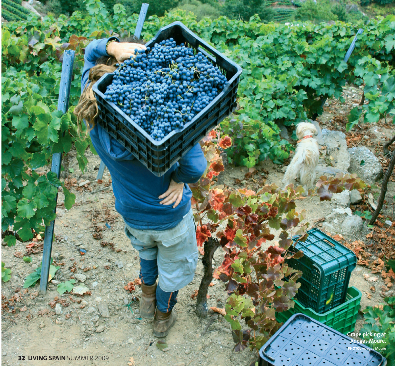
Grape picking at Adegas Moure.