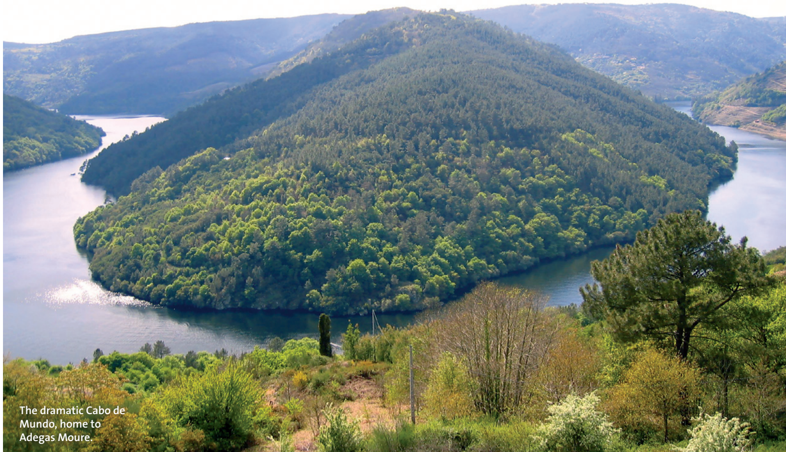
The dramatic Cabo de Mundo, home to Adegas Moure.