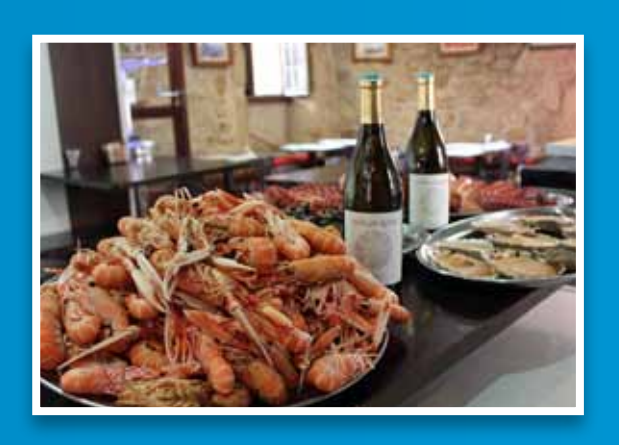
3 DAY TOUR / MAY TO SEPTEMBER From 450€ per person/day

An introduction to the region visiting the cradle of Albariño wine Cambados.